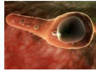
Clostridium tetani bacterium