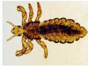
P. humanus capitis

The previously discussed STDs may also be listed here!